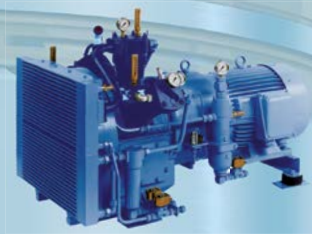
HLD on rubber-bonded metal bearing

Thanks to their well-conceived modular principle the series provide all options for use, even under the toughest industrial conditions up to 40 bars.