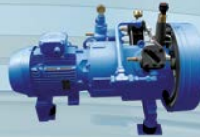
Booster on anti-vibration mounts