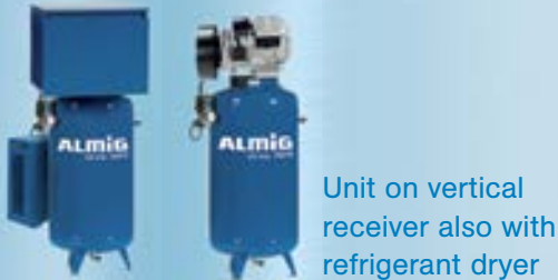
Unit on vertical receiver also with refrigerant dryer