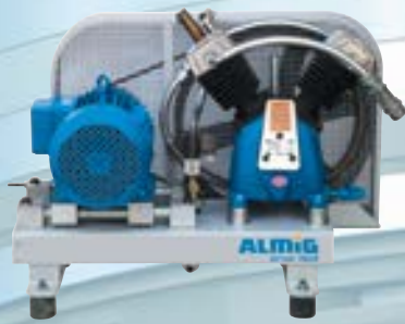
Booster on base plate