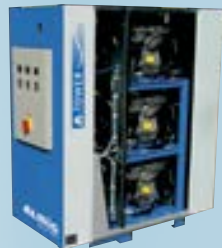
A-tower, can be configured individually with up to 3 units