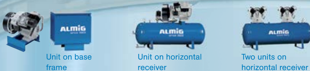
Unit on base frame