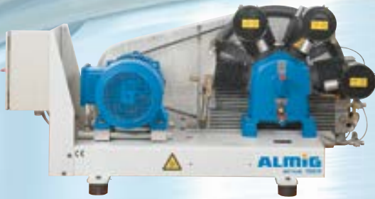
HL on base plate