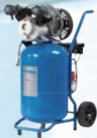
AT 6002 AT 7002