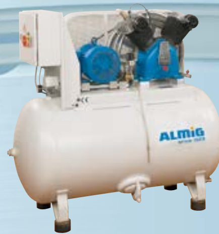
HL on receiver