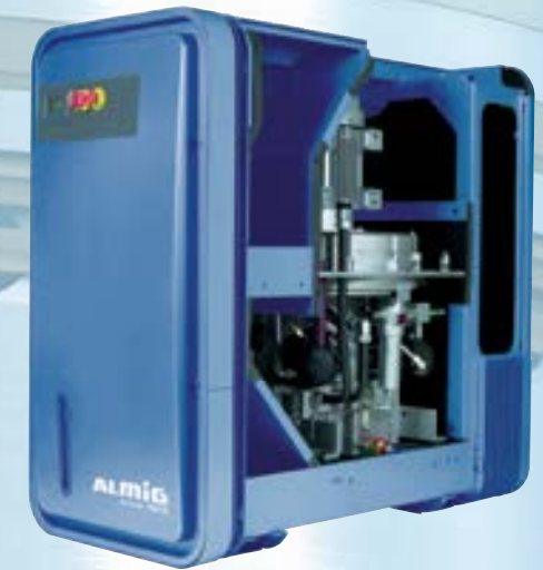
HP, in standard soundproof housing